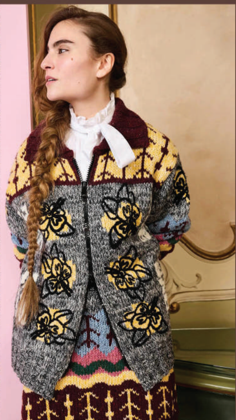
La Double J